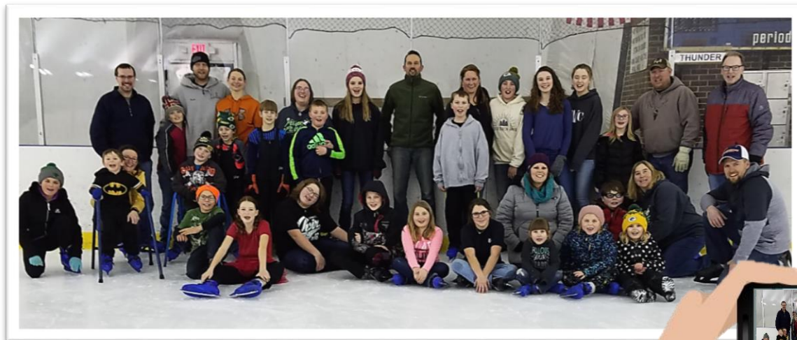
Oconto County 4-H families take a moment to make a memory and pose on the ice at the Marinette Civic center during Pasture Pirates 4-H Club's county-wide ice skating event.