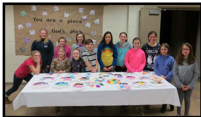
Morgan Badger members pose with Easter door signs created for Country Villa residents

On February 11, 2018, the Morgan Badgers 4-H Club held their monthly meeting at St. John's Church in Morgan. Members had a great time making Easter door signs for residents of Country Villa Assisted Living. They used foam stickers, glitter glue, and many more fun art supplies to make the signs. They all turned out beautiful! Members voted to go ice skating for the March meeting and are looking forward to a fun time!