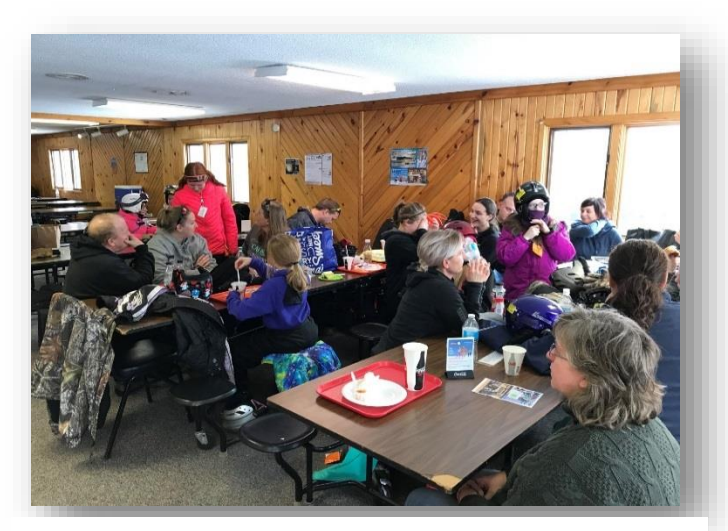
Northern Riders members stop for a break to warm up.