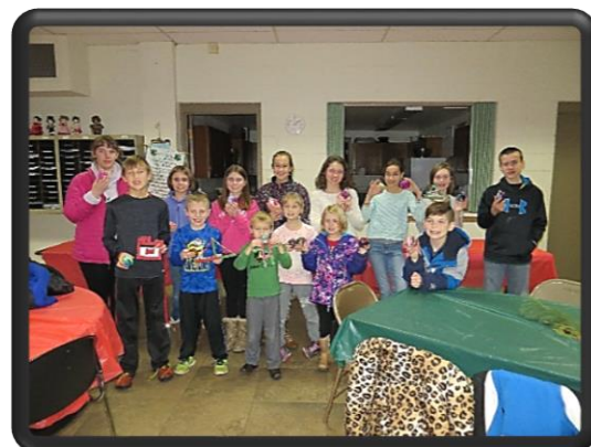
Morgan Badgers members display their handmade ornaments.

snowflake, or some of the members got creative and made up their own design out of Popsicle sticks. The second craft was swirling different paint colors in a clear ornament which made a cool pattern. The members had a great time! Morgan Badgers 4-H meets the second Sunday of every month at 5pm at St. John's Lutheran Church in Morgan. Please feel free to attend a meeting to see what 4-H is all about!