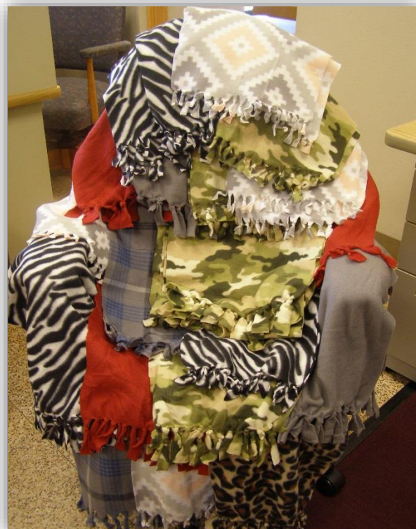
Fleece scarves made by 4-H members during the Spring Fling project Challenge event on April 7th